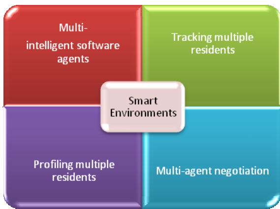
Fig. 2. Current directions in multi-agent research for smart environments.

viewed as an intelligent agent. In order to ensure that the collection of software agents is robust, transparent, and seamless, these embedded agents need to communicate and cooperate with each other.