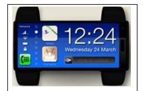
Figure 7. Futuristic wearable smart phone [17].

Smart phones. Phones, in many senses, represent the first pervasive mobile computing technology. Between 1990 and 2010 the number of mobile phone subscriptions grew by two orders of magnitude and in many parts of the world the current ratio is as high as 10 mobile phone users to one PC user [22]. Today's smart phone is as powerful as larger mobile devices were several years ago. They integrate powerful processors, multiple communication technologies, multimedia capability (e.g., audio, image) and ample storage and a multitude of sensor suites. The array of available wireless access and communication technologies means that phones may provide last-hop communication to body area and other deployed sensors that lack the power required for long-distance communication. Current smart phones can cache a great deal of information and the growing power of the cloud allows them to offload expensive computation. The emergence of application distribution channels has accelerated smart phone innovation by providing access to millions of deployed smart phone devices.