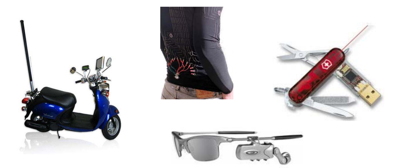
Figure 2. Pervasive computing devices are as diverse as currently lifestyles demand.

numbers of system dimensions that can increase are numerous. PeCS can scale to encompass a massive number of devices or an increasing heterogeneity of devices and the ways they communicate. The volume of data they generate, collect, store, transmit, and process will increase significantly. These systems can scale in the number and diversity of their applications and in the number of individuals and communities that utilize the systems. In order to scale effectively, PeCS must be able to increase these dimensions while maintaining or improving accuracy, efficiency, and reliability with cost effectiveness.