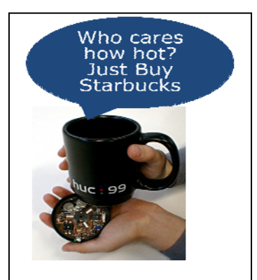
Figure 3. With pervasive computing comes increasing demand for consumer attention and, through pop-up advertisements, demand for consumer resources.

Each of the well-established areas of pervasive computing is partnered with a conceptual gap or area that needs to be better explored. While devices and applications are being increasingly manufactured and used, they are demanding more user time and attention rather than alleviating a user's burden by means of context awareness [20]. Users need to spend more time understanding the data and educating themselves about the latest hardware and software features. Pervasive computing devices are changing our fundamental way of communicating and of gathering information. As evidence, consider the statistic that 85% of children in the