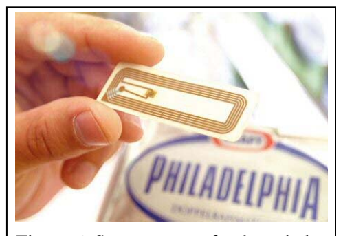
Figure 6. Smart tags on food can help ensure food safety.

Smart object applications . Applications for smart object research are diverse and immensely creative. A driving theme is that smart objects should cause change, either through actuation of other devices and services or by changing human behavior through notifications. For example, smart food can be envisioned as food items with embedded tags that record