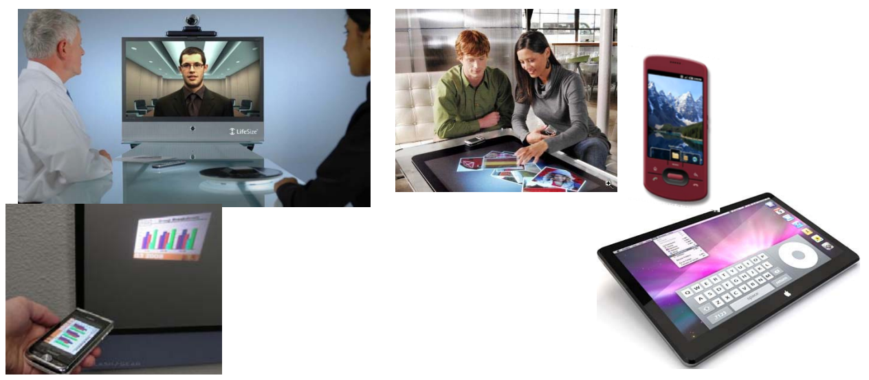
Figure 1. The proliferation of pads, tabs, and boards.

Not all pervasive computing applications are large scale or require large-scale resources and processing. However, as we look to the future of pervasive computing, ideas for large-scale use emerge and implementation of the ideas becomes more achievable. For example, while current pervasive computing systems have the ability to track individuals and analyze their behavioral patterns, future PeCS systems can scale to metropolitan area networks such as smart cities and smart communities that learn behavioral information and trends across a larger region. Similarly, current research is enabling smart vehicles, but future systems may scale to encompass an entire country's traffic system. Likewise, the Internet of Things (IoT) implies that every tagged object could be part of a very large-scale pervasively connected system across the globe. Finally, both IoT and (mobile) social networking have the potential to revolutionize as well challenge the scaling of pervasive systems.