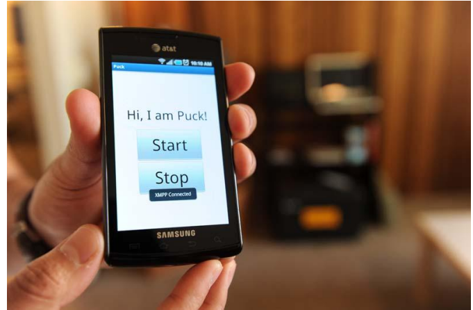
Fig 1. Smart phone-based prompting system

for IADLs is that the burden to deliver prompts that increase in level of assistance is removed from the caregiver. In order to enhance the ability to capture the attention of individuals with AD, the authors suggested using prompts with voices from family members, familiar sounds and smells. Tailoring prompt voices to be familiar to the individual will increase context based prompt effectiveness according to CRT.