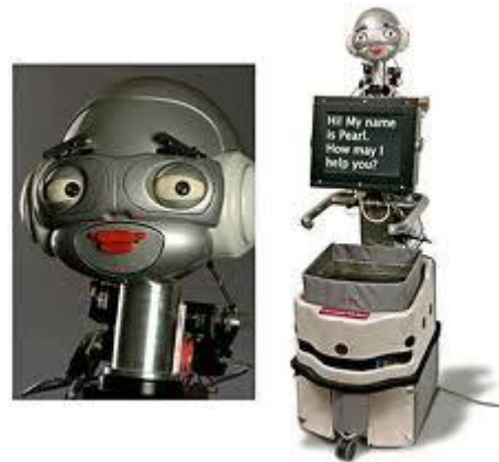
Fig 3. Nursebot: Robot designed to assist elderly people with daily activities

Within the context of CRT, behavioral change theory posits that adopting new strategies requires that individuals have positive experiences and be satisfied with the outcome. In addition, an integrated approach that addresses cognitive, emotional and motivational aspects of functioning together in addition to techniques is necessary for effective rehabilitation. Therefore, perceived utility of assistive technology [87] and how the technology might positively or negatively impact social network, emotional functioning, and lifestyle [88], [89] are important to older adults' acceptance of assistive technologies. In one study, older adults reported that the most