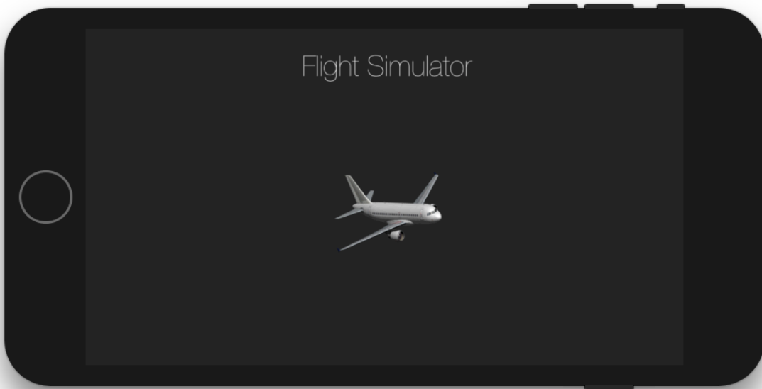
iPhone 8 Plus - 11.3