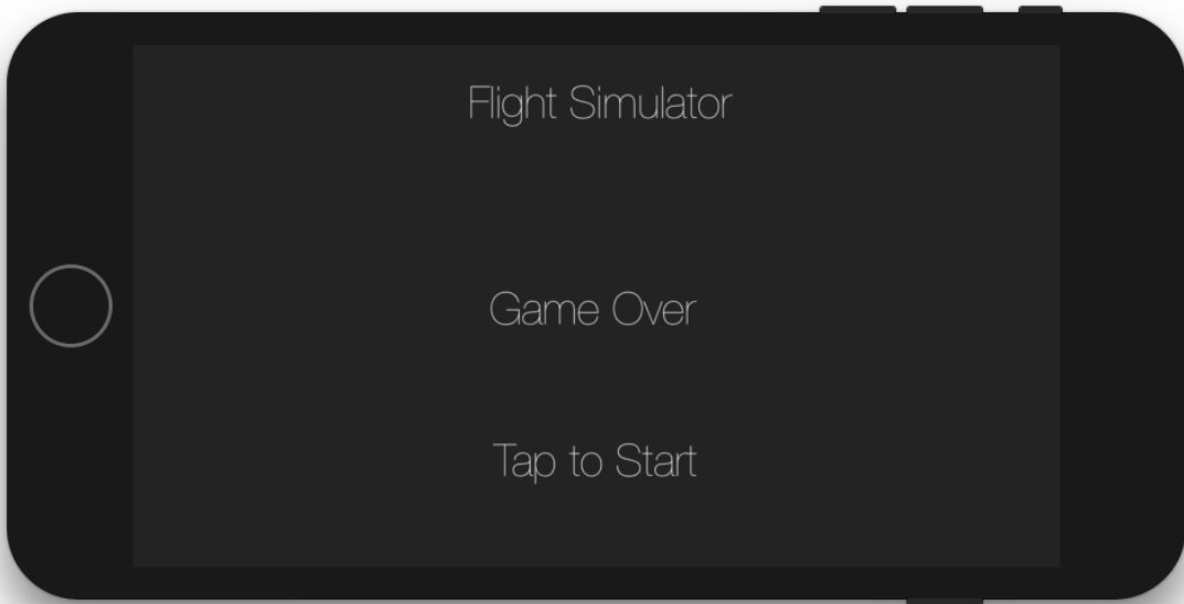
iPhone 8 Plus - 11.3