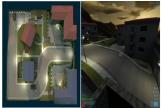
Figure 2: Urban area map (left) and in-game player view HUD (right).

have defined simplified games within these worlds that portray realistic urban warfare scenarios and simple tasks. Figure 2 shows one such environment (UCT_Apartments) and the heads up display (HUD).